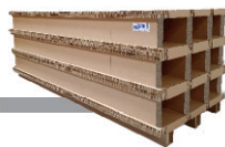
PALLITE® PIX® Horizontal