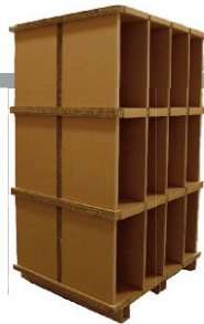
PALLITE® PIX® Twin