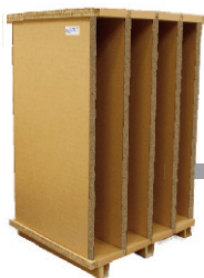
PALLITE® PIX® Vertical