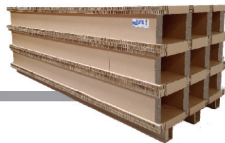
PALLITE® PIX® Horizontal