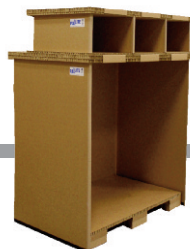
PALLITE® PIX® Topper